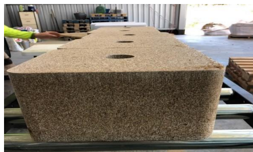
*8% Phosphorus block plus micro minerals & vitamins including biotin and 25-hydroxycholecalciferol