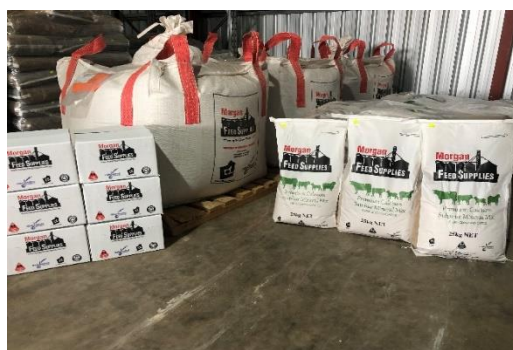
Boxed Lick blocks, bulk concentrates and Calcium Sulphur Mineral Mix ready for distribution.